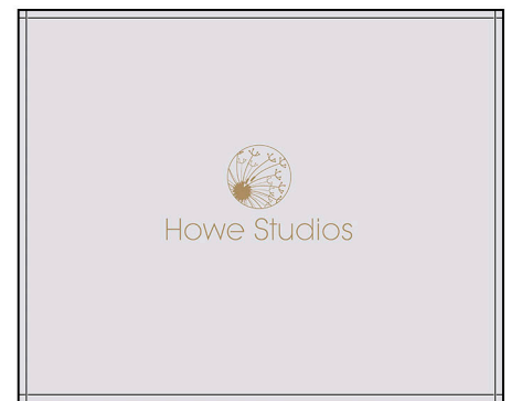
Sample box base