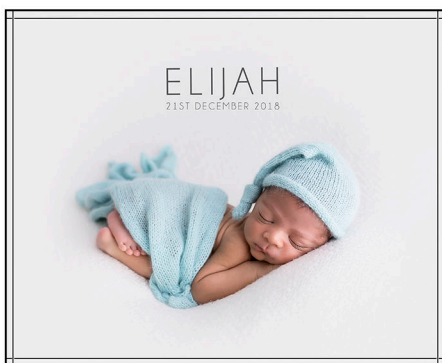
Sample Image lid