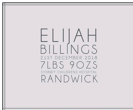
Sample lid image (underneath lid)