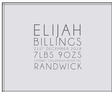
Sample lid image (underneath lid)