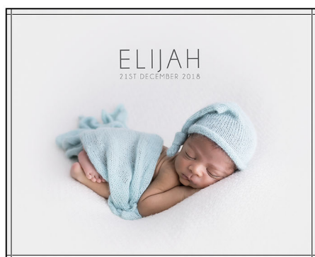
Sample Image lid